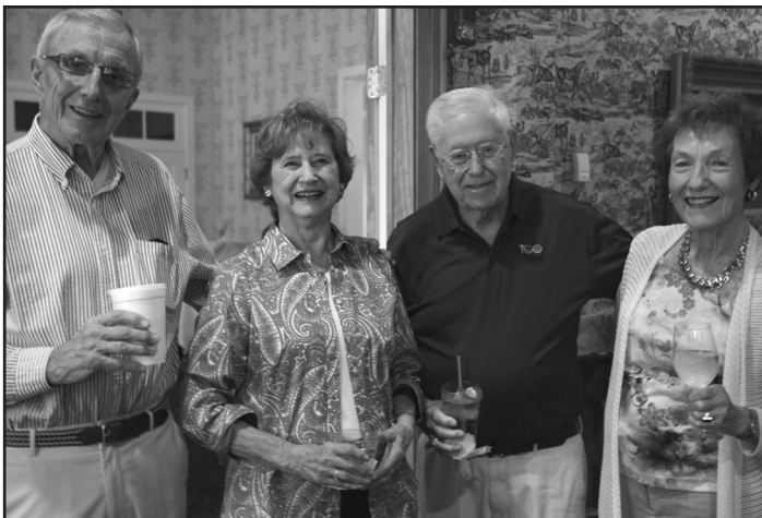
Memorial Day Fun