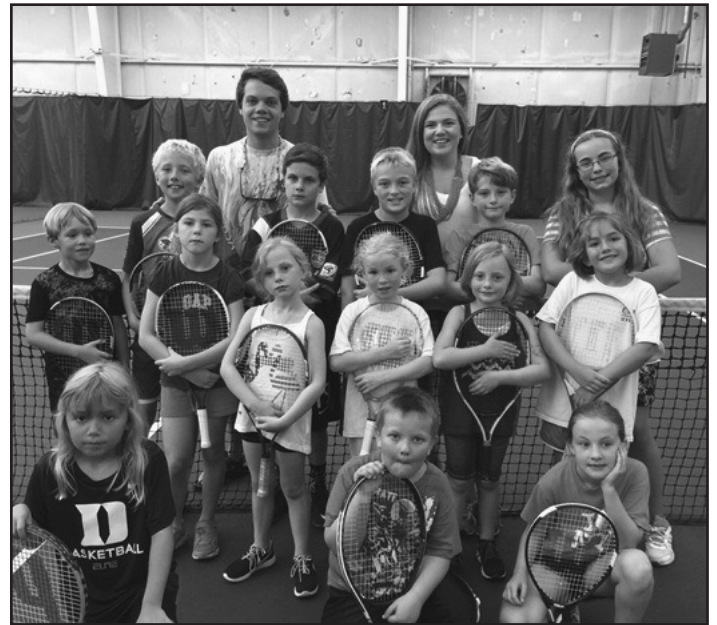
Summer Camp, June 2015