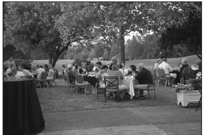
Jazz and Martini Night